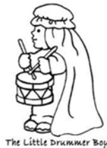
The Little Drummer Boy

Pa..... A new born King to see Pa..... Our finest gifts we bring Pa..... To lay before the king Pa..... Ra.... Ra...|